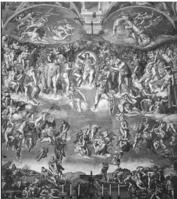
Michelangelo's Last Judgement (Sistine Chapel)

This last Sunday after Pentecost ends our annual liturgical journey through the spiritual history of the world which begins anew each year with the First Sunday of Advent.